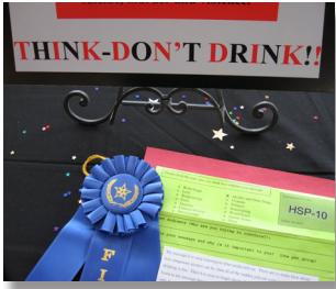
M GEN FEST winner

Let's face it, growing up's a risky operation. There was time, before vaccinations and penicillin, when parents just wanted children to live beyond diphtheria and flu. Now, families manage that. But they struggle to keep teenagers